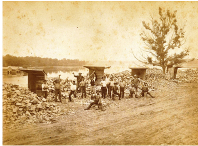
Independent workers would set up sheds along Montello Lake and cut paving stones to sell. What is now Doty St.

7. Walk east on Park Street. This area was once all connected to the granite quarries. Men making paving blocks lined the street. The quarry hole was one of three quarry sites in Montello. Different granite companies owned each pit at one time. The quarry hole you see is about 150 feet deep. The small office building on Park and Doty St corner was built in 1919 and housed the granite company office. The 70 foot chimney was built in 1944 and used 23,000 bricks. Today it is used by migrating chimney swifts as a roost. The Elite Marble building was the polishing shed built in 1951 after a disastrous fire.