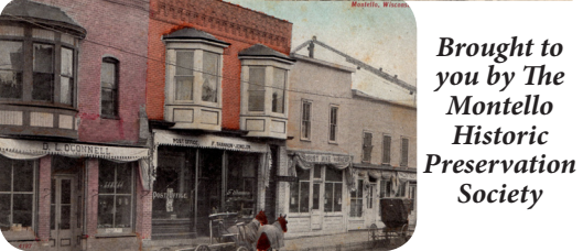
Brought to you by The Montello Historic Preservation Society