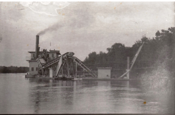
Dredge on the Fox River