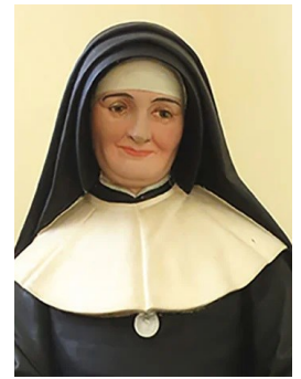
Feast Day: April 8