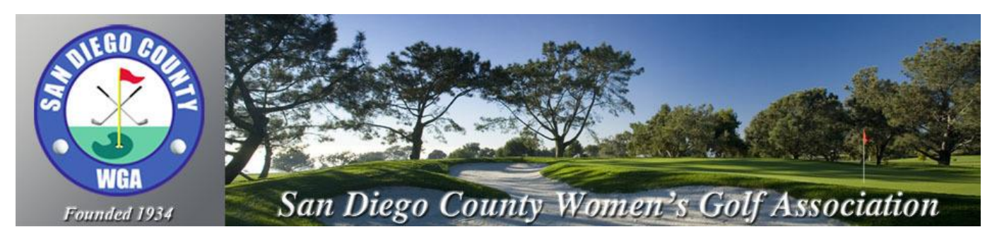
Welcome to USGA Tournament Management Association, powered by Golf Genius Software.

During the initial setup, SDCWGA will enter all the team captains into the system along with their email. At some point, we will send team captains an invitation email.