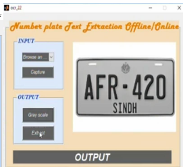
Figure,4. (Gray Scale Image)

After select the image convert it into gray scale image as per figure 4. Gray scale image is very useful to extract text from it.