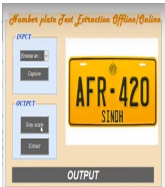
Figure,3. (Interface after select an image.)

Figure 2, shows the basic interface of our project. After that simply click on select image and click on browse and open the image in interface. We also use live cam option to take any image. Figure 3, shows the interface after selecting an image.