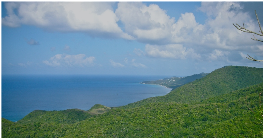
Photo 1 – St. Croix's north shore from Spring Garden (Maroon Ridge)

The Spring Garden parcels are located within St. Croix's largest area of contiguous forest, at approximately 6,000-acres. This greater forested northwest region of the island includes the majority of St. Croix's mature dry and subtropical moist forest. Protection of Spring Garden forests, at the upper reaches of the Caledonia Gut, will prevent erosion and runoff that can impact sensitive downstream marine communities.