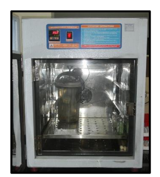
Figure 2: Incubator