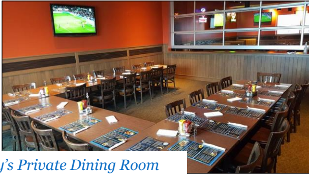
Harvey's Private Dining Room Seating for up to 40 people

~ Host Tab – Open bar, we will add it all up if you do not wish to have tickets.