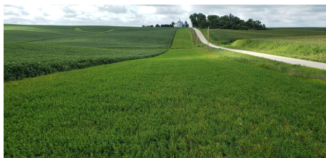
Field border (headland)