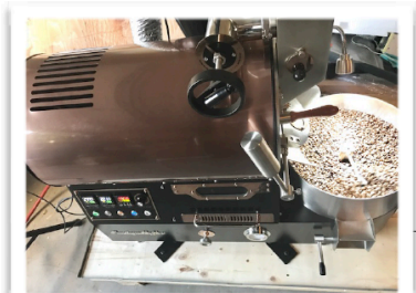
BC-3 HAS TWO 76MM (3") EXHAUST PIPES

THE BC-3 MD IS A HEAVY DUTY ROASTER BUILT WITH A CARBON STEEL BODY WITH APPROVED POWDER COAT HIGH TEMPERATURE BODY IN BLACK. THE HOUSINGS COME IN A CHOICE OF 4 COLORS (Gold, Rose Gold, Black Titanium & Stainless) In two type finishes (MIRROR or MATTE) TWO EXHAUST PIPES COMES OFF THE BC-3 AT 3" AS SHOWN BELOW AND CAN BE EXHAUSTED OUT OF BUILDING SEPARATELY OR CONNECTED WITH A BLAST OR BACKDRAFT DAMPER