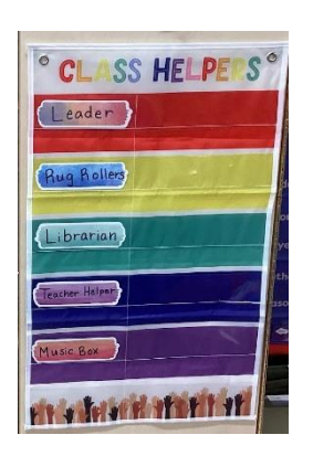
classroom helpers (jobs)

Information will be sent out soon about the upcoming Valentine's Day celebration on Wednesday, February 14th.