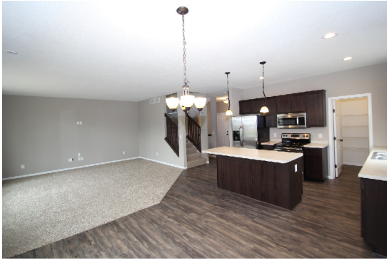
*SOME OPTIONS MAY BE SHOWN*