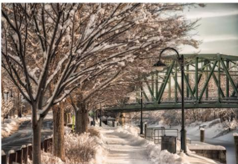
After the Storm