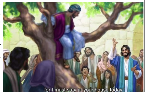
for I must stay at your house today.