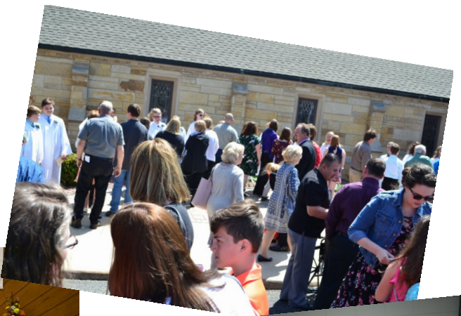
Confirmation PK 4 Muffins for Mom PK Spring Program Awards Banquet