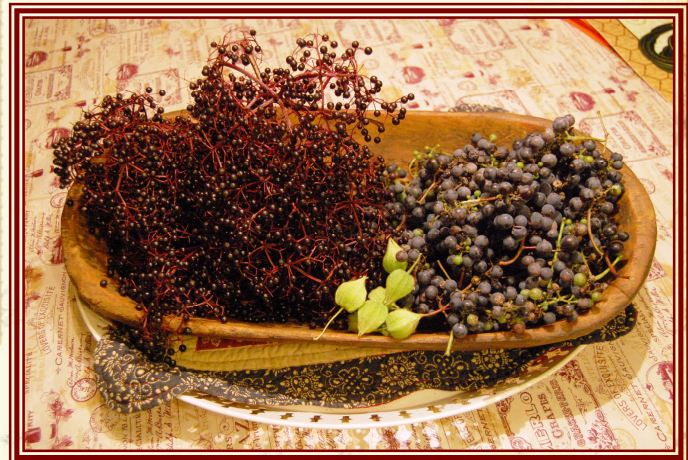
Elderberry, ground cherry, & grapes from the farm!

color, this fruit makes one of the best jellies that we've ever tried. We've also made a few batches of elderberry syrup that was just delectable on pancakes! The grape harvest was equally as bountiful and also yielded plenty of juice to make lots of grape jelly. There's really no comparison between the store-bought stuff and the flavor and texture you get with home-made preserves. The challenge now is going to be tempering our taste buds to make the jelly last us through the winter!