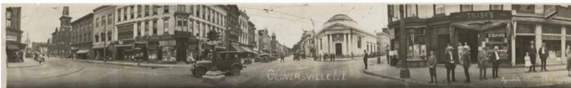
PANORAMIC DOWNTOWN GLOVERSVILLE PHOTO