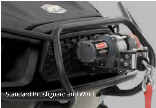
Standard Brushguard and Winch