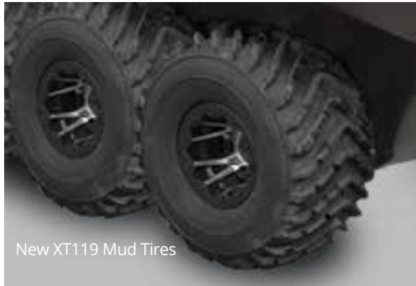
New XT119 Mud Tires