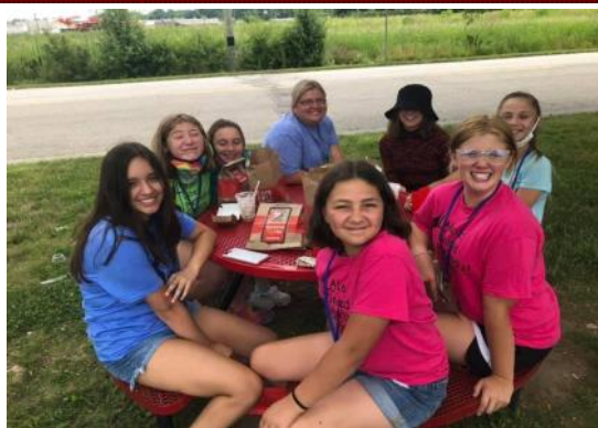
AUMC Mission Trip Group

The 2021 YouthWorks Mission trip to Louisville, Kentucky was a great success! All participants left Aledo with servant hearts and grew those hearts with each service partner we helped! I hope you were able to join us for worship on Sunday, August 22 to hear personal testimony from the missionaries. If not, please ask any of them to tell you about their trip the next time you see one of them. They would love to share their experiences with you! Please check out the pictures from our week in Kentucky.