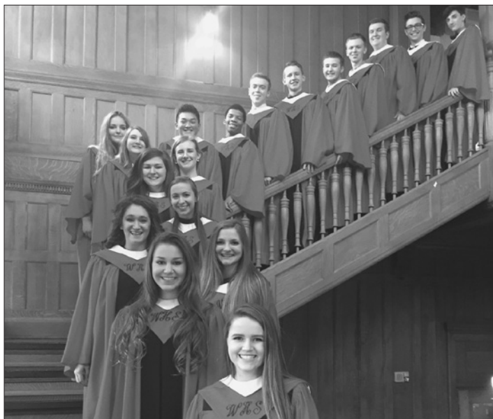
Choral students representing Westside High School pose for a photo before the 2016 All-State Choral Festival.

Westside was well represented at Nebraska's 2016 All-State Choral Festival, November 16-18 in Lincoln. A total of 18 vocalists were selected to participate in this year's festival: