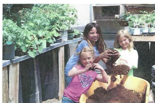
Pine show 2022