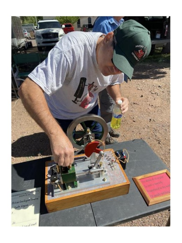
Prescott show 2022