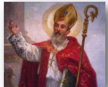
Feast Day: January 13

Sources: mycatholic.life and catholicnewsagency.com