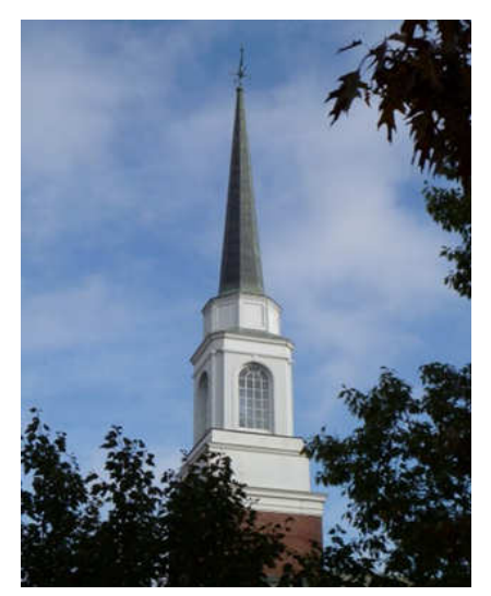
February 2021 Volume 67 No. 2

FIRST BAPTIST CHURCH 200 Lynn Ave. Ames, IA 50014-7188 Worship Sundays 9:45 am