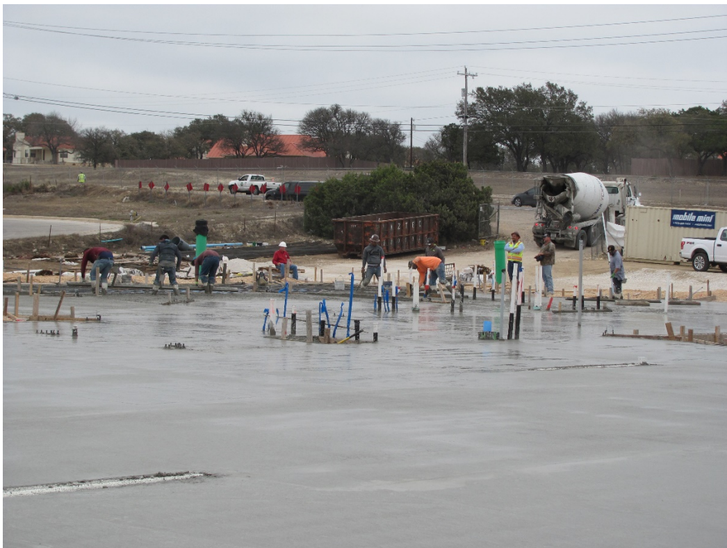
EXHIBIT 9 – OFFICE / DORM AREA 01.29.2021