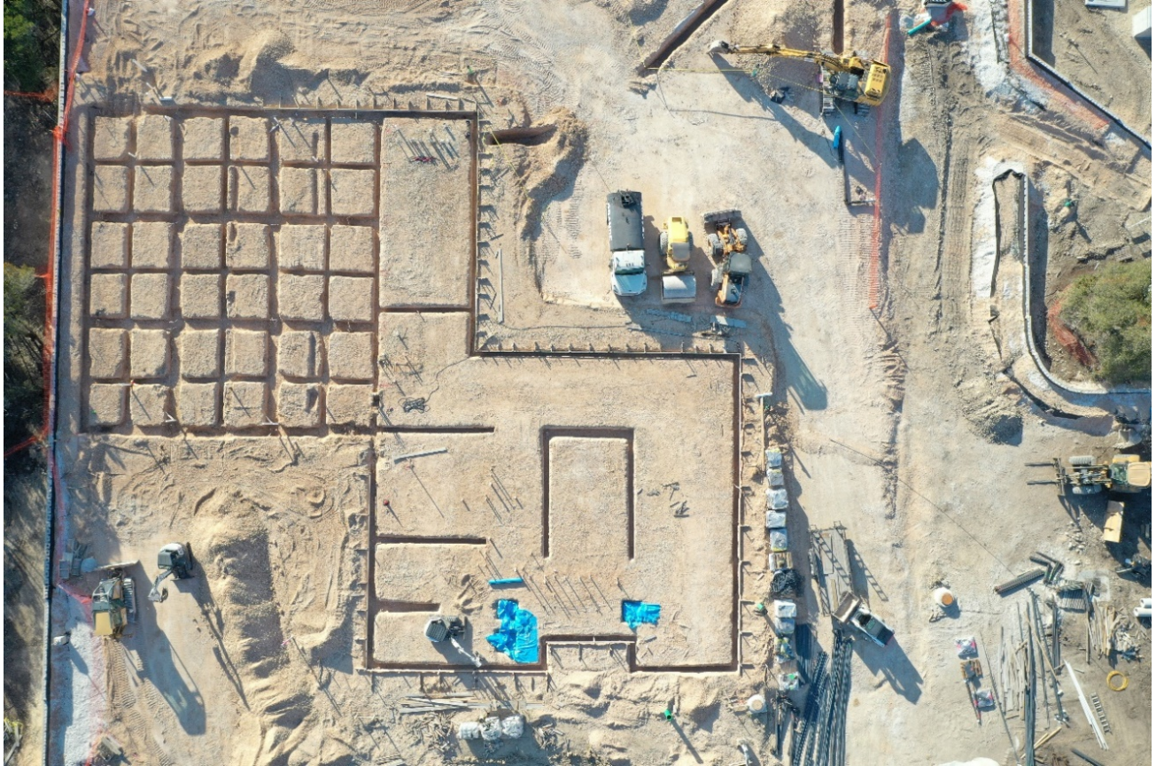
EXHIBIT 1 – OVERALL SITE 01.30.2021