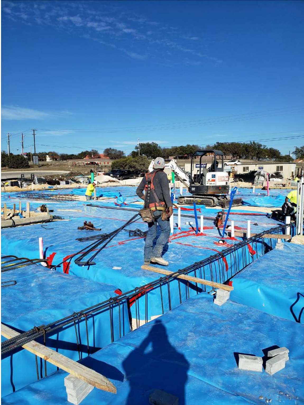
EXHIBIT 2 – OFFICE / DORM AREAS 02.02.21