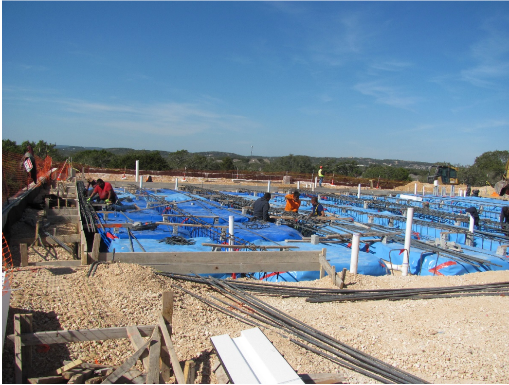
EXHIBIT 4 – APPARATUS BAY / SOUTH EDGE OF BUILDING 02.03.21