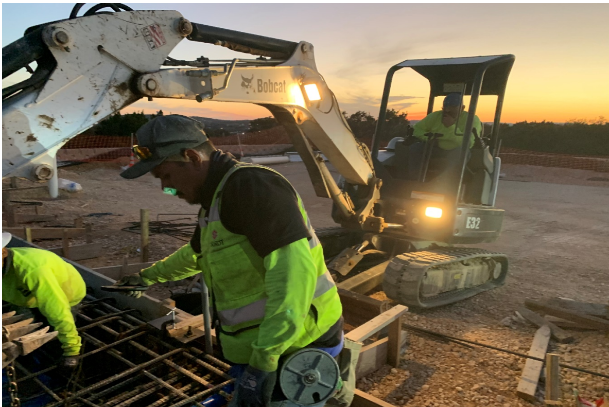
EXHIBIT 7 – APPARATUS BAY / WEST END 02.23.21