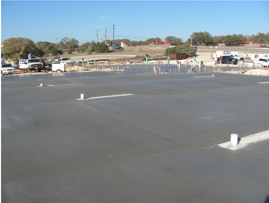
EXHIBIT 12 – APPPARATUS BAYS → ACROSS BUILDING 02.24.21