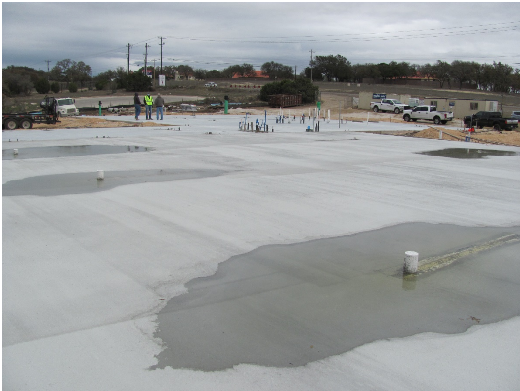
EXHIBIT 15 – APPARATUS BAY DRAINS 03.01.21