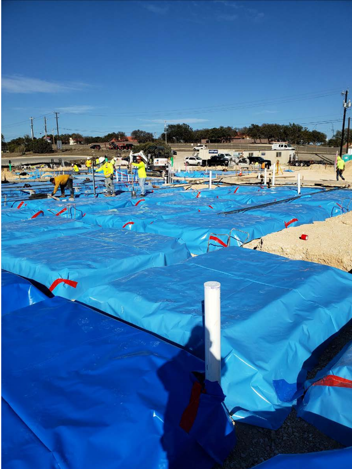
EXHIBIT 3 – APPARATUS BAYS 02.02.21