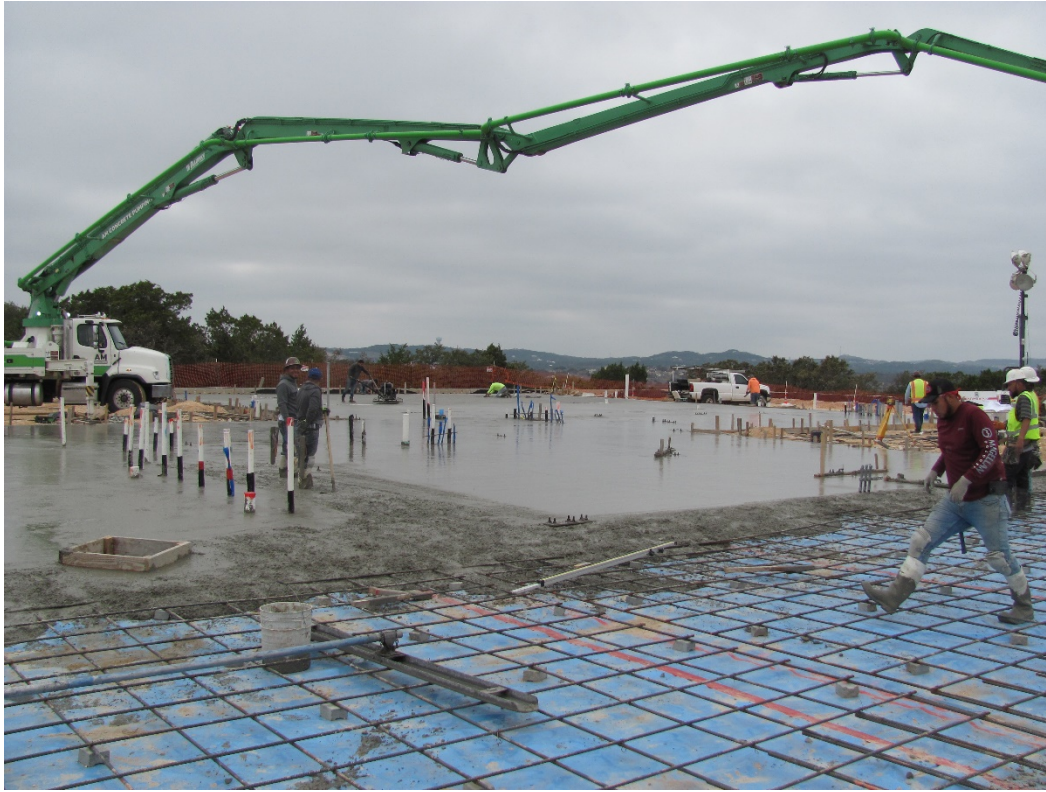
EXHIBIT 10 – OFFICE / DORM AREA 02.24.21