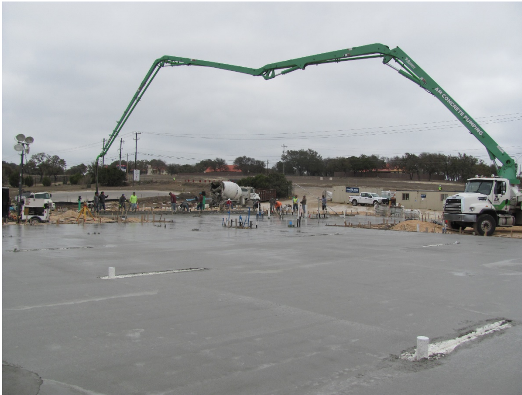
EXHIBIT 8 – APPARATUS BAY → ACROSS BUILDING 02.24.21