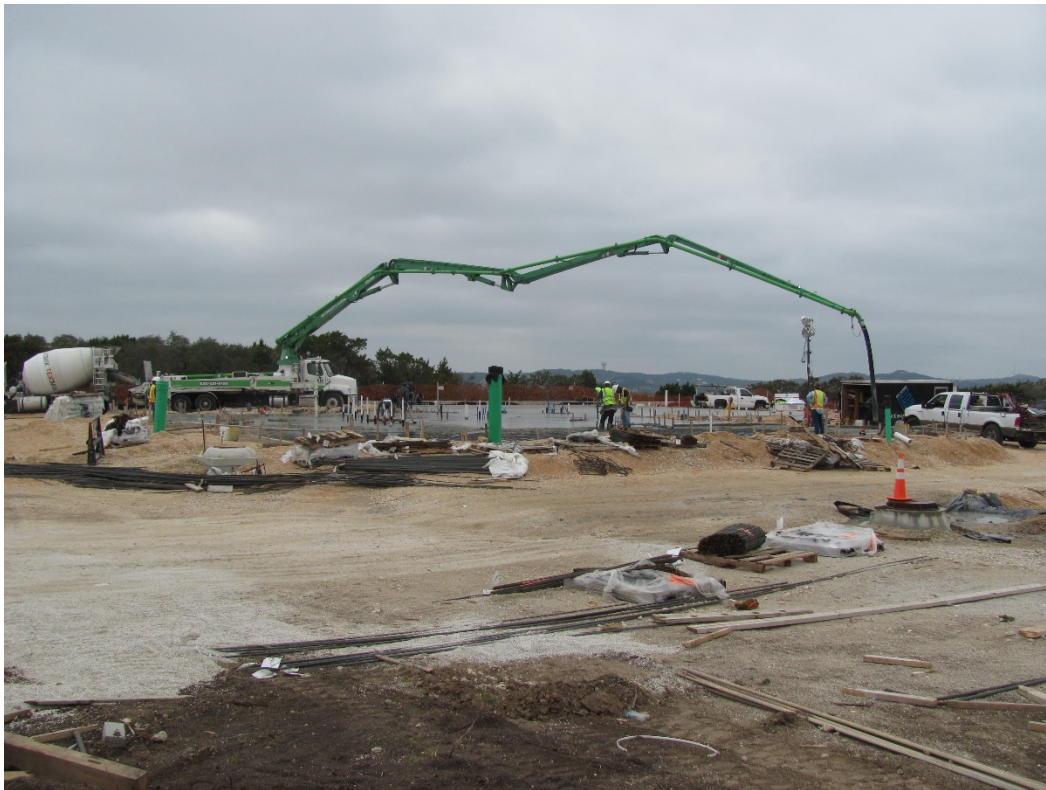
EXHIBIT 11 – BUILDING FOOTPRINT 02.24.21