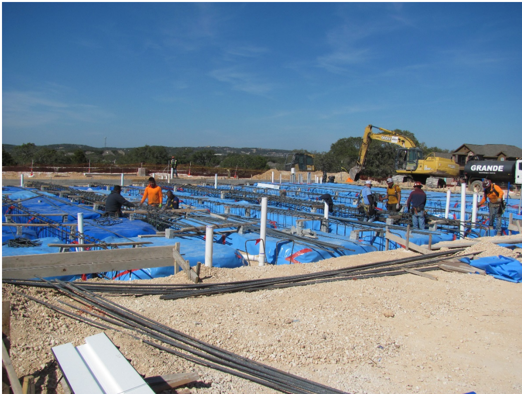
EXHIBIT 5 – APPARATUS BAYS / WEST EDGE OF BUILDING 02.03.21