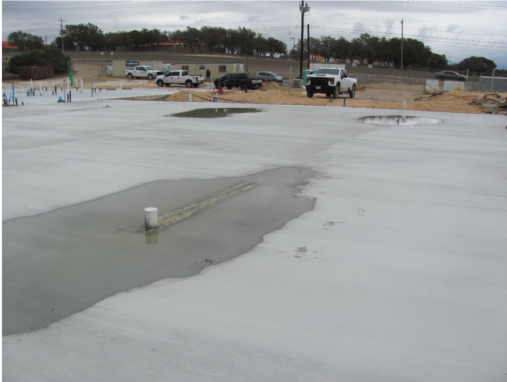
EXHIBIT 14 – APPARATUS BAY DRAINS 03.01.21