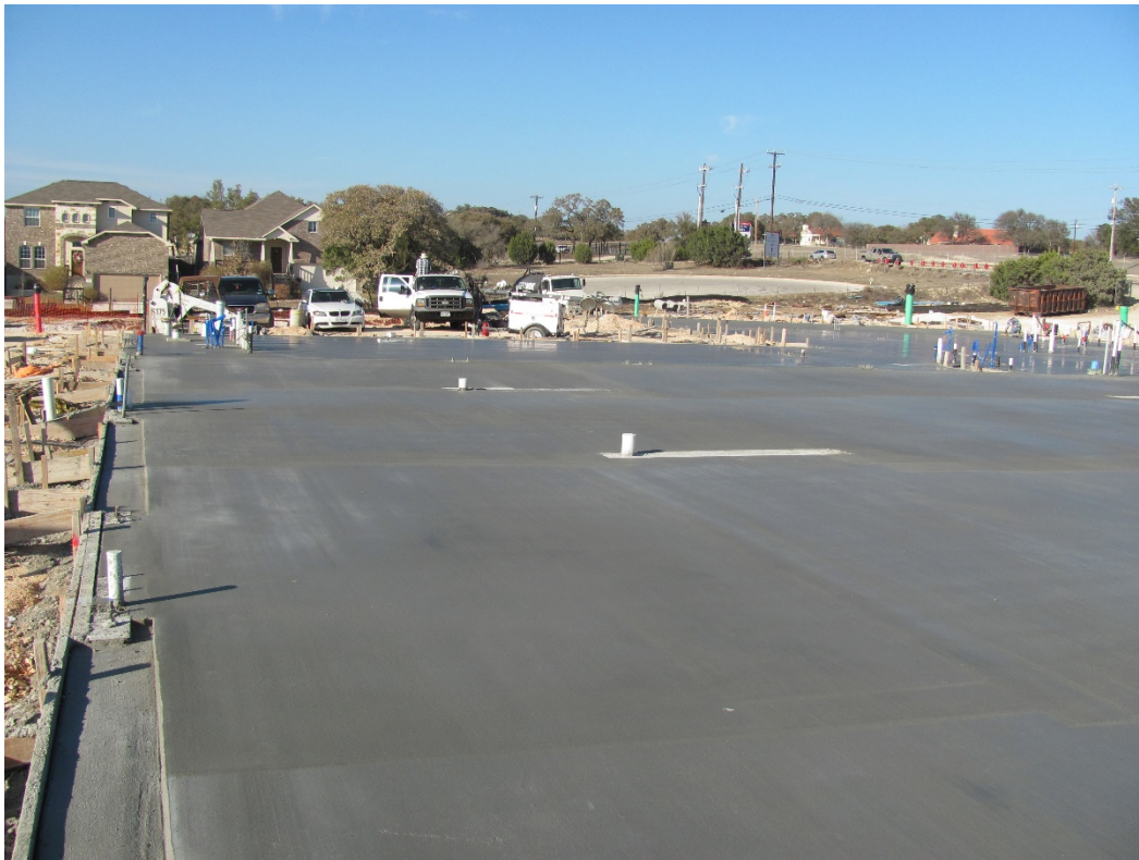
EXHIBIT 13 – APPARARTUS BAYS / DOOR RECESS 02.24.21