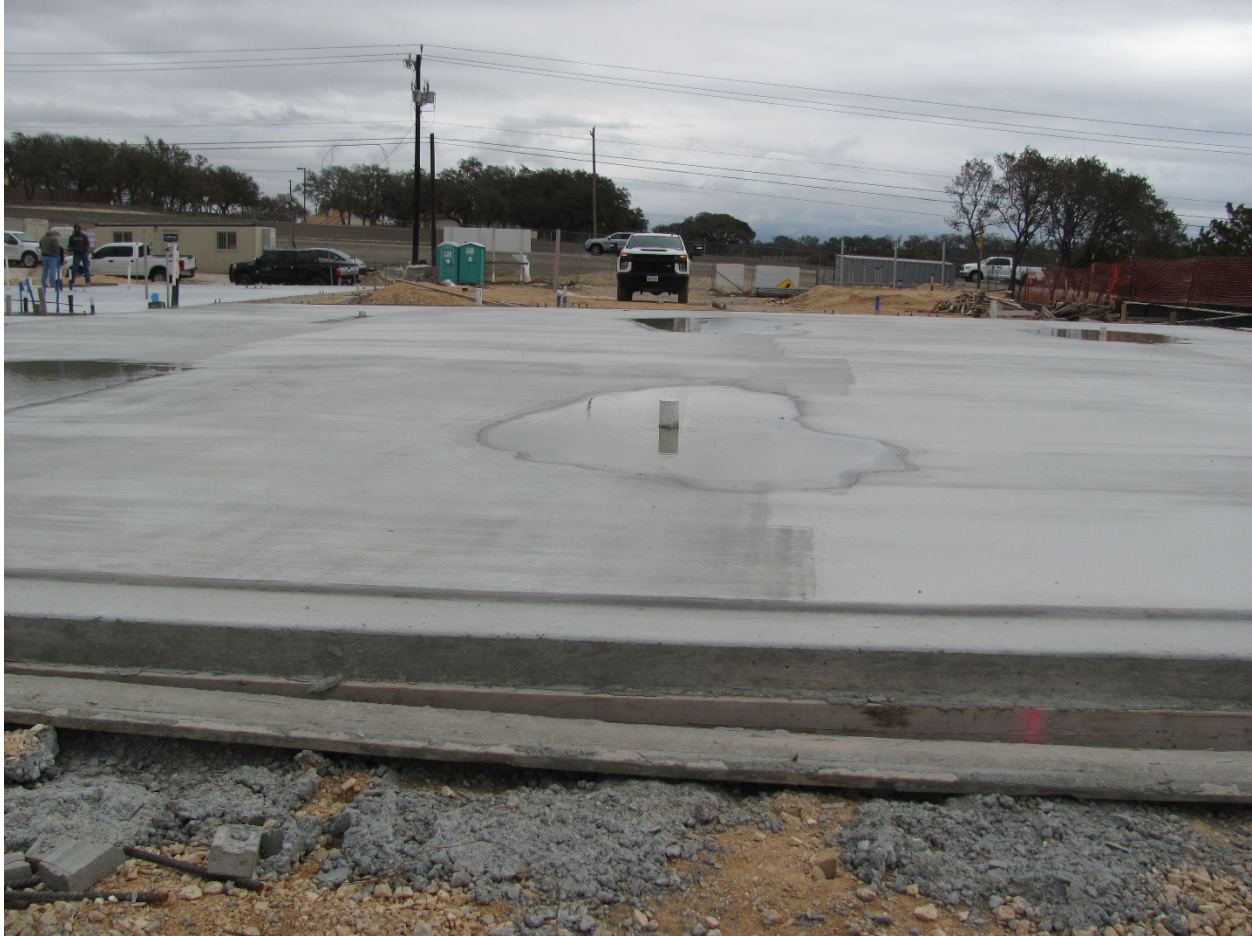
EXHIBIT 16 – APPARATUS BAY NO. 01 03.01.21