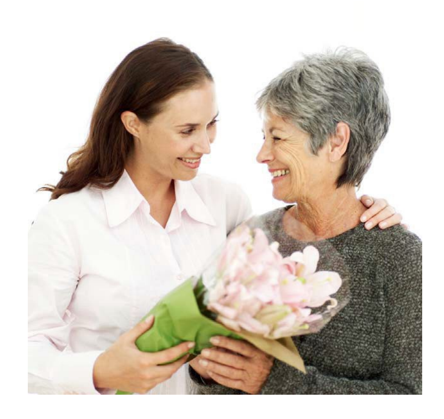
Guidelines for IHSS Care Providers

In-Home Supportive Services Provider Handbook