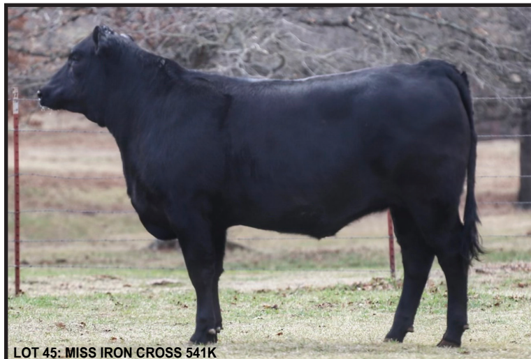
LOT 45: MISS IRON CROSS 541K

541K is a front pasture Heifer. 12 traits in the top 30% with the ability to breed to any bull. Her carcass scans puts her in a very elite category revealing a prime reading of -7.22 IMF and 11.73 REA. She is one to build a herd around. PV & GE PD.