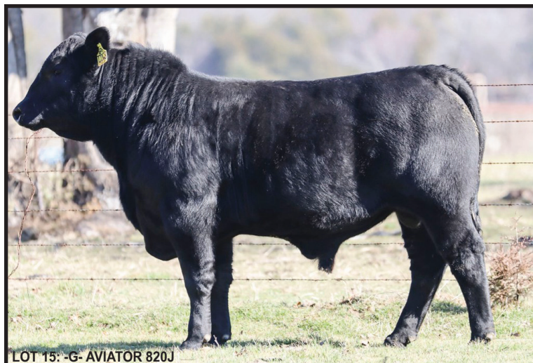
LOT 15: -G- AVIATOR 820J

UB2, This Aviator son is backed by the 820 cow family. He could definitely implement good feet and legs into his offspring. Passport X Aviator w/ a top 25% in YW and WW.