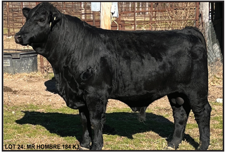
LOT 24: MR HOMBRE 184 K3

His depth of rib muscle and bone make him stand out on the short list. He is a Three D son and like his sire shows natural muscle and growth.