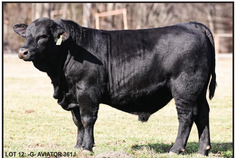
LOT 12: -G- AVIATOR 361J

UB1. Its hard to pass up this bulls bold rib and smooth shoulder coupled with his muscularity, he would make the perfect fit for any operation.