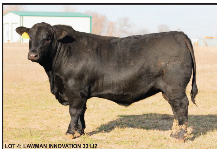
LOT 4: LAWMAN INNOVATION 331J2

331J2 is a innovation son, you wont find a bull that offers more natural muscle and length. He moves out very well and has good feet under him moderate BW coming into life at 73 lbs. PV and GEPDs.