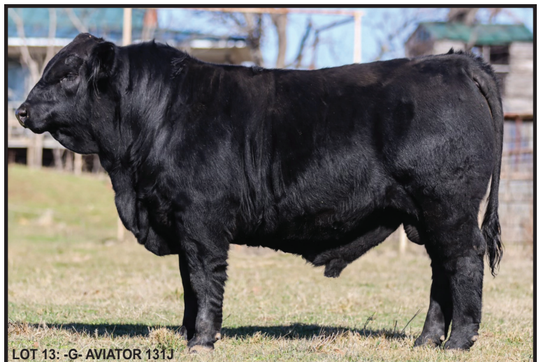
LOT 13: -G- AVIATOR 131J

Smooth shouldered UB2 that offers tons of depth. With 7 traits in the top 30% of the breed or better. He is a calving and growth bull that can be used on heifers or cows w/ an actual BW of 67 lbs.