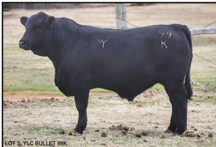
LOT 3: YLC BULLET 99K

First Bullet son to sell, shows to be long, clean, and very thick. Actual BW of 62 lbs. PV and Genomic Enhanced EPD's.