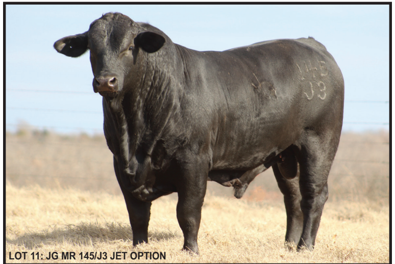
LOT 11: JG MR 145/J3 JET OPTION

Very attractive bull in his makeup w/ a perfect sheath design, which is extremely important in our breed. This guy is very sound on his feet and legs which will allow him to have a long longevity in the pasture as a breeding sire.