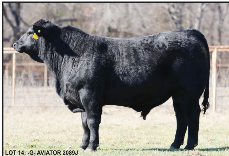
LOT 14: -G- AVIATOR 2089J

True heifer bull with a CED and BW EPD in the top 4% of the breed and an actual BW of 56 lbs. This muscular big hipped Aviator son is sure to be a stand out on sale day.