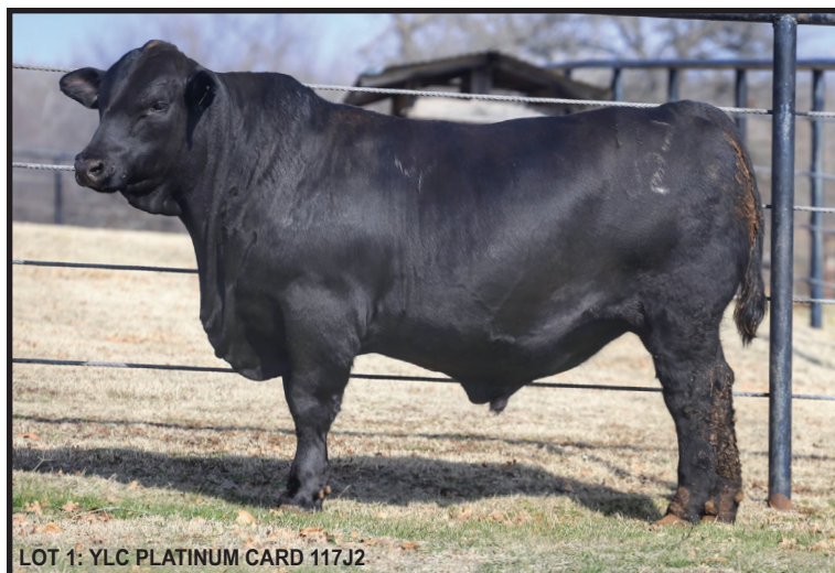
LOT 1: YLC PLATINUM CARD 117J2

True herd bull prospect. Thick, moderate, & docile, outstanding genomic panel with 5 traits in the top 4%. Young Cattle Co. reserves the right to collect 100 units of semen at the cost of the production.