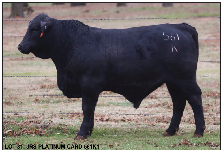
LOT 31: JRS PLATINUM CARD 561K1

561K1 is sporting a top 2% WW, YW, and REA. He is a growth bull w/ the added consistency of 10 traits in the top 35%. Thick, deep, docile, w/ added bone. Use to increase pounds at weaning and yearling. PV and GEPDs.