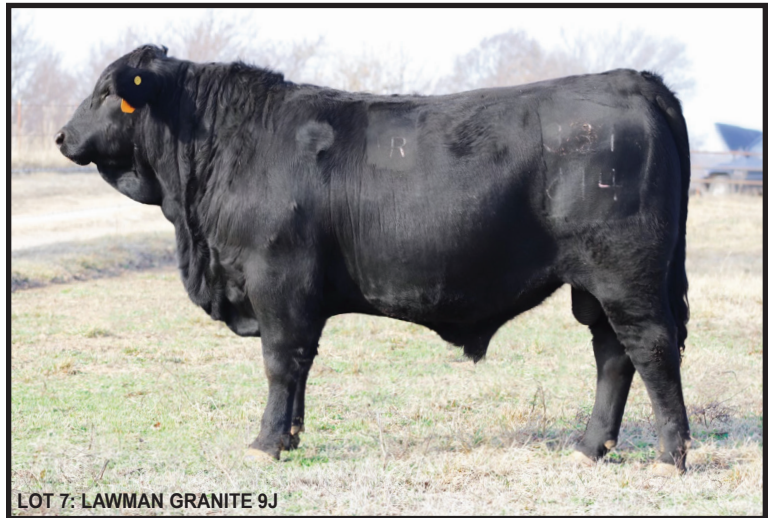
LOT 7: LAWMAN GRANITE 9J

R numbered Brangus bull that is a calving ease prospect. Very deep bull that can be used on heifers or cows. Out of a very fertile 9 cow family. Bull was branded wrong at weaning and his true PHN is 9J.