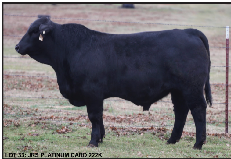
LOT 33: JRS PLATINUM CARD 222K

222K is a power bull w/ top 4% or better genomic EPDs for WW, YW, TM, and REA. He had a WW approaching 700 lbs. Excellent phenotype w/ a clean underline. 222K is a stockman's bull. PV & GEPD's.