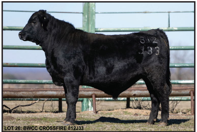
LOT 26: BWCC CROSSFIRE 812J33

Crossfire son that goes back to Cruise on top and Jethro on bottom side. Bull that shows outstanding growth numbers with moderate BW. Use this bull to add proven genetics and growth.