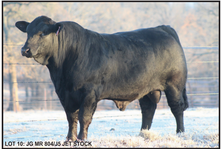
LOT 10: JG MR 804/J5 JET STOCK

When looking for a bull that's put together right, check this guy out. You will love his rib shape and the red meat he displays. He displays and actual BW of 73 lbs and WW of 748 with no creep.