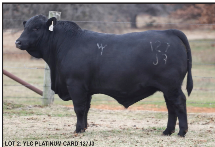
LOT 2: YLC PLATINUM CARD 127J3

Phenotypic standout with a moderate frame and large body. Very impressive genomic standout showing 11 traits in the top 25% of the breed. Top 4% in WW, YW, REA, and Term. Actual BW 60 lbs.