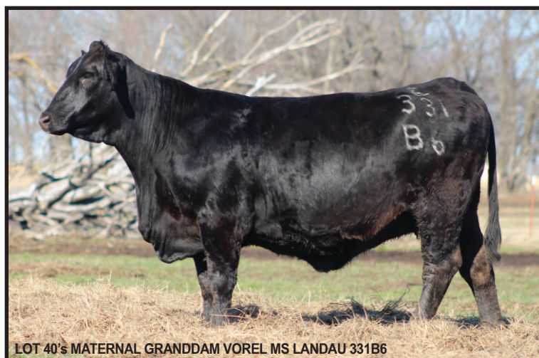
LOT 40's MATERNAL GRANDDAM VOREL MS LANDAU 331B6

ET heifer that is out of the Business Line. Very rare to see a Business Line daughter hit the market. Her donor dam has had highlight bulls and females in several big production sales. This heifer has a world of breeding opportunities displaying great growth, carcass, and SC values. Potential Donor Dam in the making.