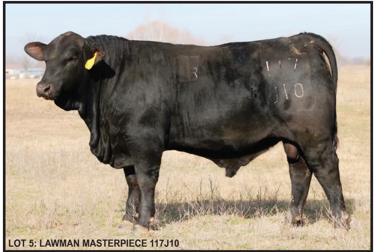
LOT 5: LAWMAN MASTERPIECE 117J10

ET calf out of a tremendous female making donor cow. He displays 8 traits 25% or better in his geneomic makeup. His half sister was a highlight at Cavenders years ago that went on to be a great donor dam for the Cavender herd.