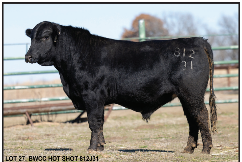
LOT 27: BWCC HOT SHOT 812J31

Two year old UB 2 bull that has Blackwater genetics. Has a -1 BW EPD to use on heifers and added growth genetics for a mature cattle herd.