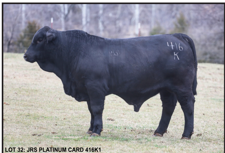
LOT 32: JRS PLATINUM CARD 416K1

416K1 is an animal. Low BW w/ top end growth genetics ranking top 3% for WW, YW, REA, and TERM. He had a natural BW of 60 lbs and grew that to an adjusted 674 lb WW. Must have for any herd. PV and GEPDs.