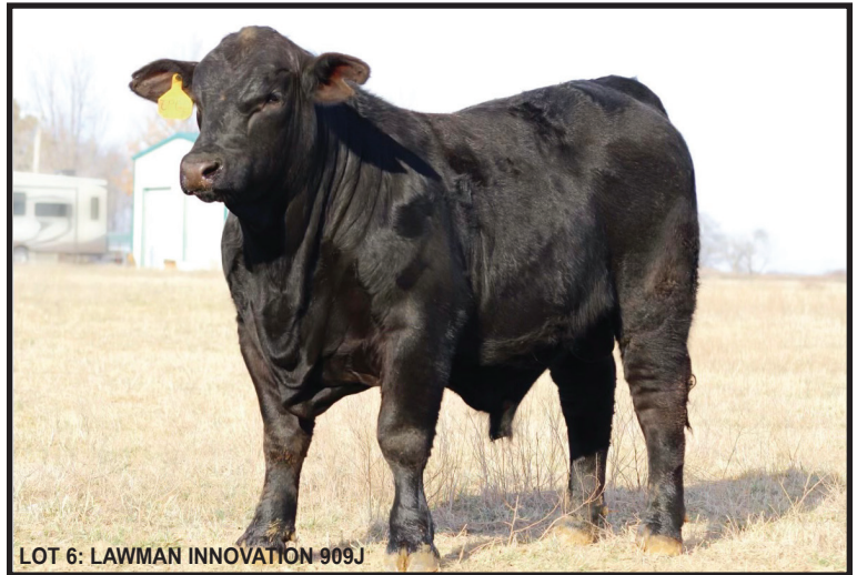
LOT 6: LAWMAN INNOVATION 909J

very attractive bull with a powerful stance. Moderate in his make up but had power through his middle and top. Very sound at every angle. PV & GEPDs.