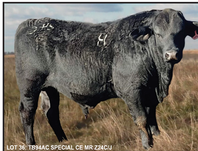
LOT 36: TB94AC SPECIAL CE MR Z24C/J

Top 3% milk, 25% IMF with a 675 actual WW. Summit cow on maternal side. Very gentle and never fed fat.