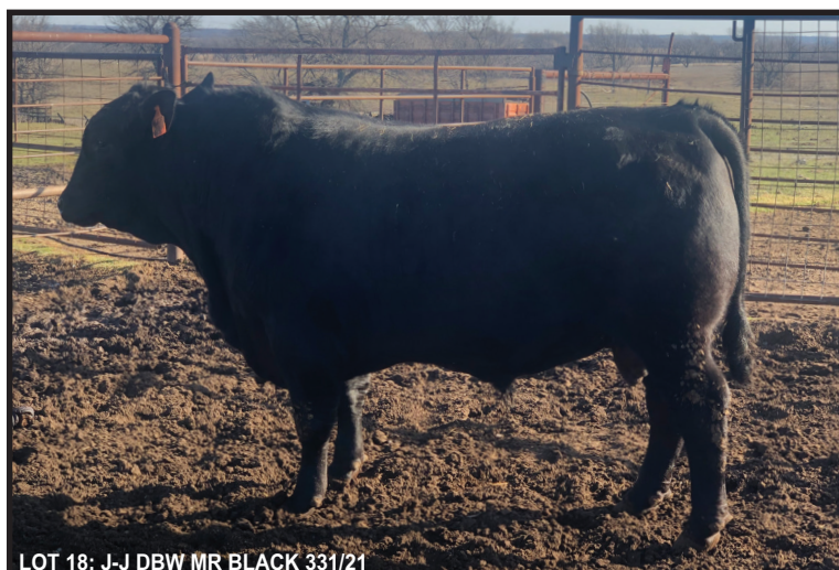
LOT 18: J-J DBW MR BLACK 331/21

Coming two year old bull that shows to be a heavy muscled with big bone under him. He is out of a good Tradition daughter who milks well and raises big calves. Make some replacement females out of this bull.