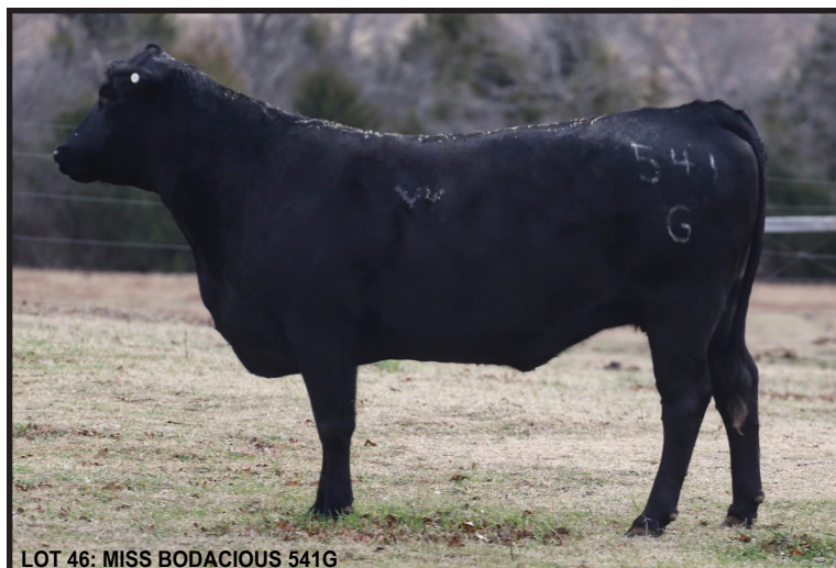
LOT 46: MISS BODACIOUS 541G

Not very often can you take home an excellent cow in the prime of her life w/ outstanding phenotype and EPD panel highlighted by top 4% carcass & Term values. She is bred to MC Platinum Card 188F8. Calving date will be provided sale day. PV and GE PD.