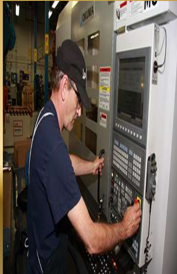
New skilled Joinee