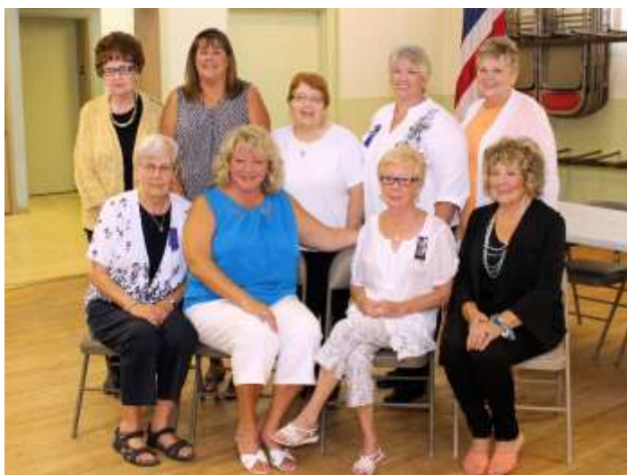
Auxiliary Unit 346 Officers for 2014-15