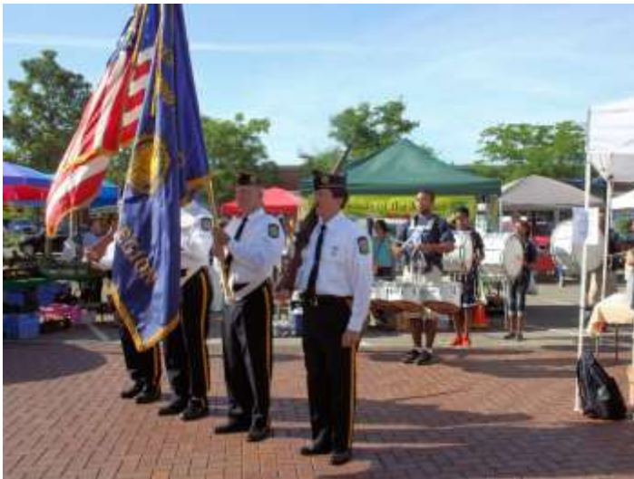
Post 346 Honor Guard and the Farmington High Falcons Drum Corp. were on hand for the Market's July 4 th holiday weekend opening ceremonies.