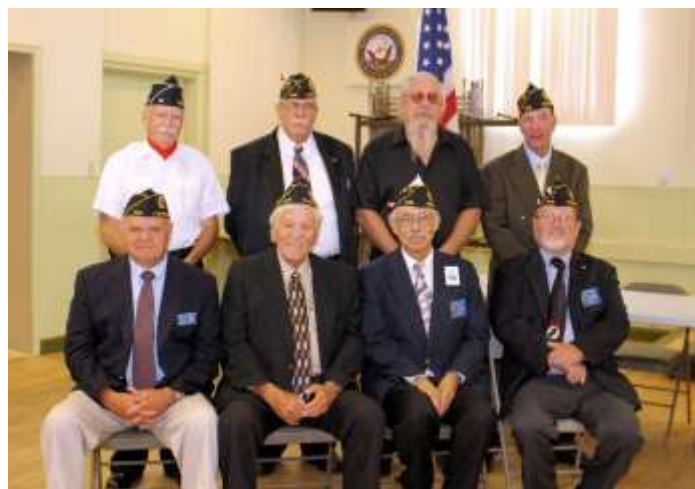
Legion Post 346 Officers for 2014-15