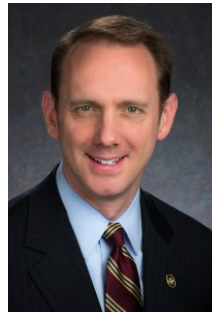
Senator Scott Sifton