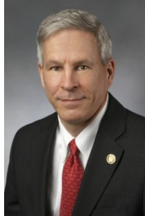
Senator Rob Schaaf

Please show your appreciation to one or more of the Missouri legislators who defended the animals during the 2017 legislative session!