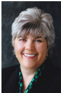
Senator Gina Walsh