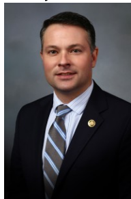
Senator Jake Hummel