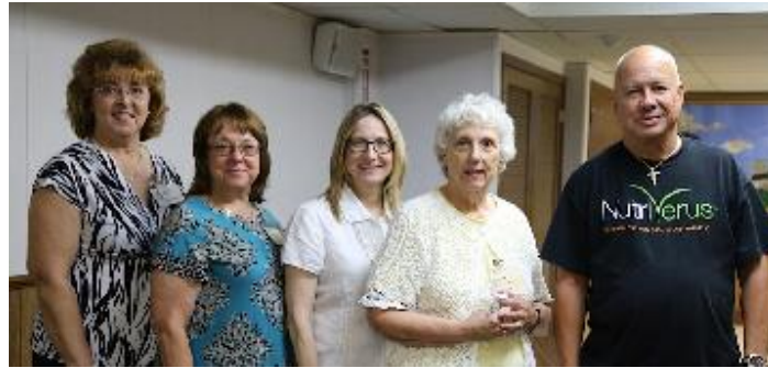
Happy Birthday to our August celebrants.