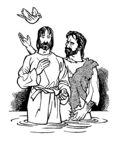
May be reproduced for Ministry Use