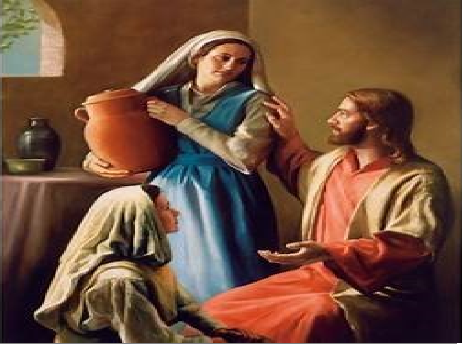
“Mary has chosen the better part and it will not be taken from her”.