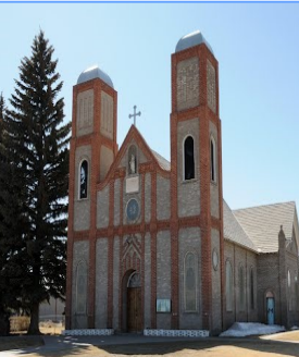
Our Lady of Guadalupe Parish Oldest Parish in Colorado Established in 1857