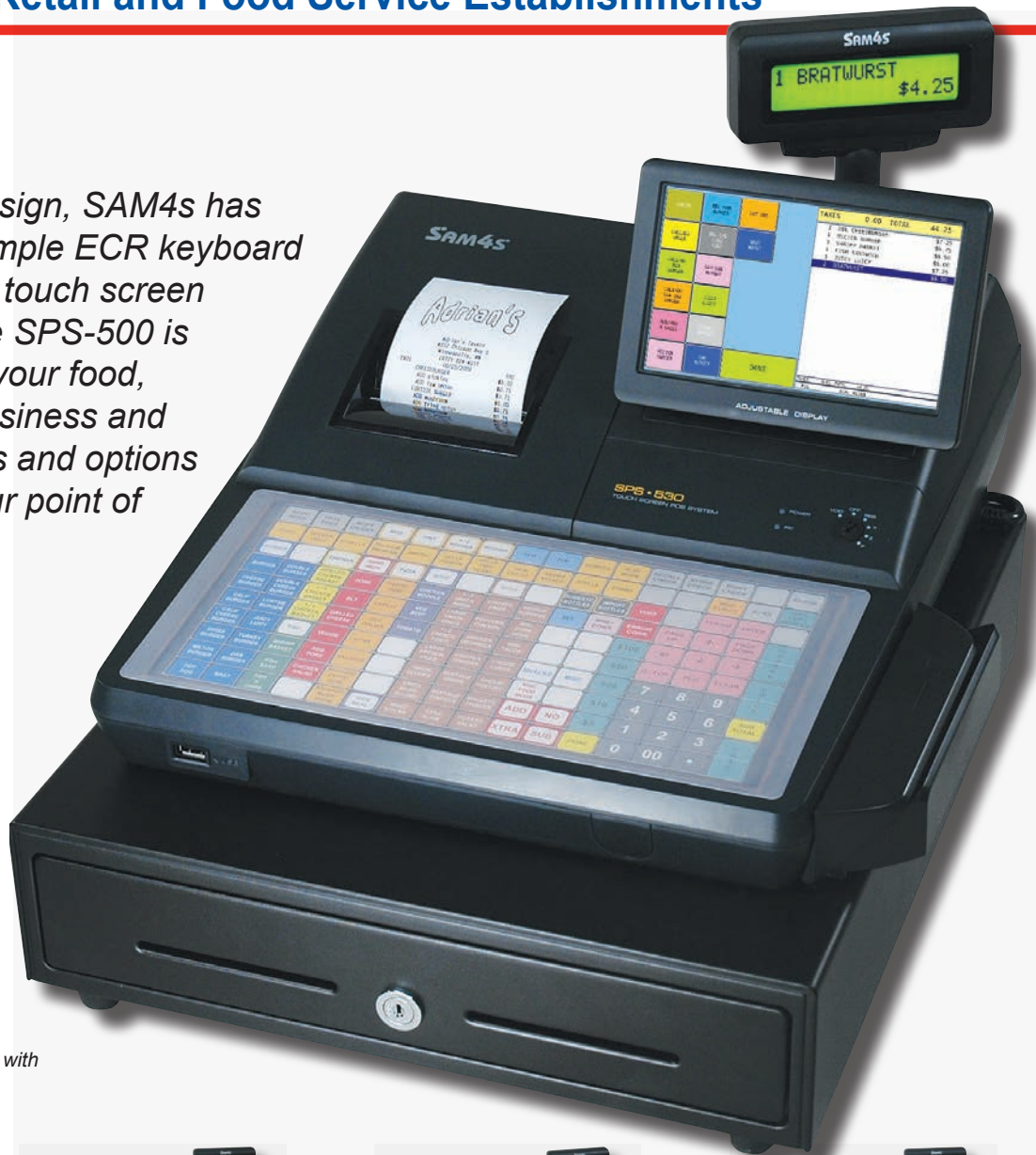
SPS-500 Series Hybrid ECRs Shown with Optional Card Reader

Featuring a hybrid design, SAM4s has combined fast and simple ECR keyboard entry with an intuitive touch screen operator display. The SPS-500 is easily configured for your food, beverage, or retail business and provides the functions and options you need to meet your point of service needs.