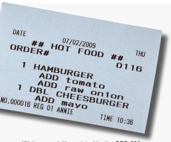
Kitchen requisition printed by the SPS-530 80mm receipt printer shown 75% actual size.

Poll by dial-up or Ethernet connection. Companion software for your PC, SAM500, supports your application by first polling sales information from individual ECRs, ECR networks or multiple remote locations. In your office SAM500 provides item file management and inventory functions. You can easily add or delete menu items and send new menu screens to your restaurants for daily, weekly or seasonal promotions.