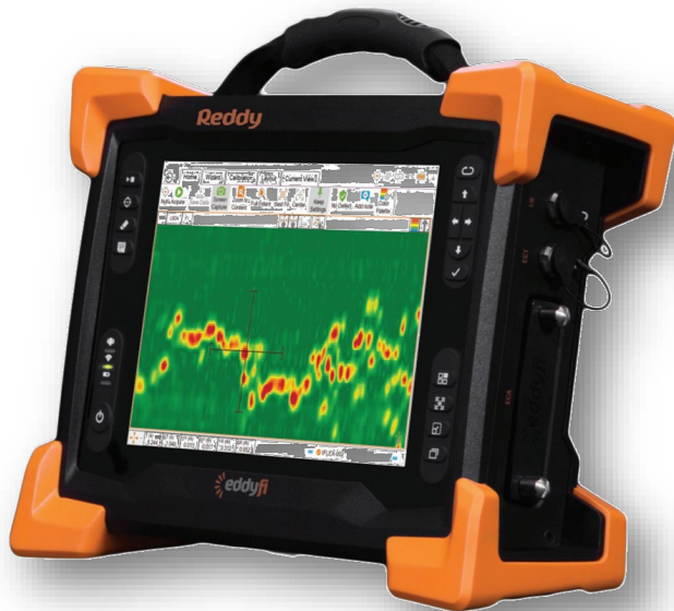
Eddyfi Spynet™ Reddy ECA

Eddy Current Array (ECA) is a digital electromagnetic NDE technique that has proven to be a more efficient alternative.