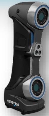
Creaform HandySCAN 3D™

Corrosion in Mechanical Damage: Pipecheck software is the one and only solution on the market to offer sophisticated tools able to extract corrosion depth that is located within a mechanical damage. This confidence will result in lower maintenance cost and reduced risk of costly failure.