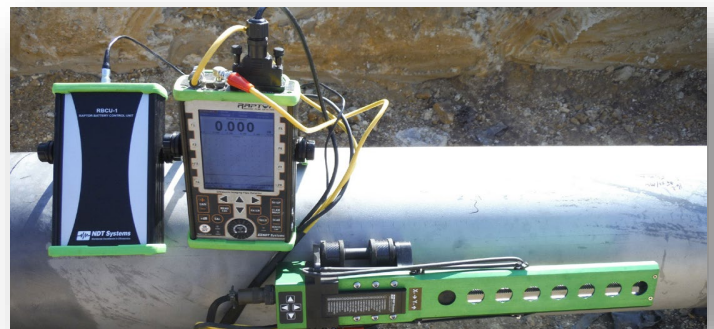
Flaw Detector and Corrosion Inspection System