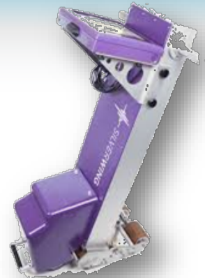
Silverwing MFL Floor Scanner