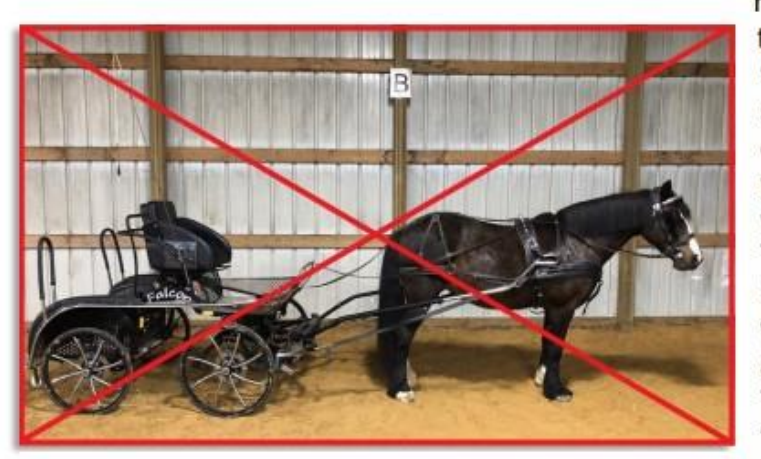
This pony is completely unattended. This is incredibly dangerous and should never be done.

More people looking to social media for help with their new carriage driving activities. Along with this, we are able to see firsthand the number of people who are truly unaware of the dangers of turnouts (the combination of horse and carriage) being unattended . Many beginners want help learning how to adjust their harness, how to put their horse to the cart, or just share the excitement of putting their