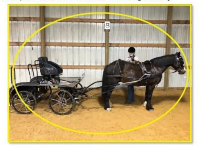
Above: Sometimes adjustments do have to be made, but the driver's time on the ground should be very limited and strong caution should be taken.

Many new drivers will cite the practices of the Amish in terms of justifying tying their hitched horses, "The Amish do it all the time..." The difference between the average Amish horse and the average competitive or recreational driving horse is that the Amish horses are working horses who travel for miles every day or exert plenty of effort in the field. They aren't companion animals that are worked once in a