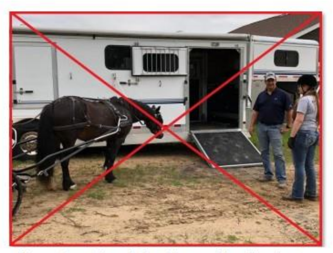
Above: Even though the driver and her friend are only a few steps away, if the pony would decide to pull back and break away from the trailer, it could quickly get away before they could do anything about it, resulting in a large disaster.

The other comment we hear is that "My horse knows how to stand, he won't move." This is great! We all love driving horses who stand like rocks. The spirit of the rule, however, addresses the "what if". Horses are naturally flight animals. If it reacts to a sudden loud noise, it may not stand. If the horse gets stung by a wasp, it may not stand (and who would expect it to!). We've seen horses who react to something and expect the driver to be there to take ahold of the reins. For that split second, the horse pauses after they react, almost like they are looking for