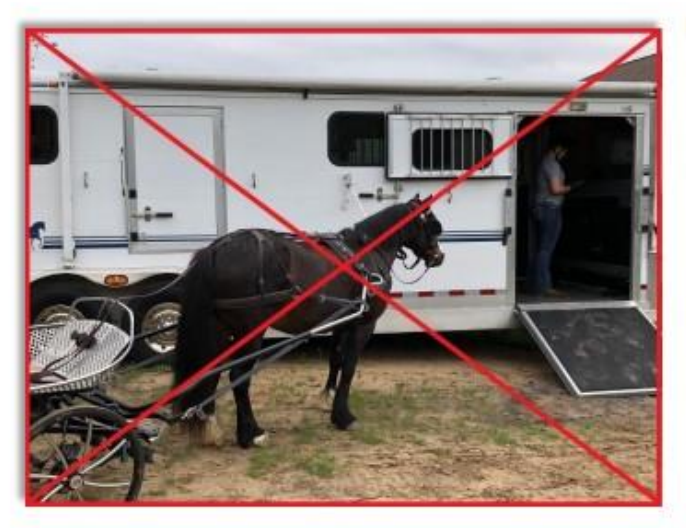
Above: The driver is in the trailer only a few feet away from the pony, but she is looking at her phone. This pony is unattended in more ways than one!

If no one is holding the horse at all, or the horse is tied to something while the vehicle is attached. and that horse happens to get away, the results are much more disastrous than if it were just a loose riding horse. That vehicle becomes a weapon which has been known to take out anything in its path...if it even survives the experience. We've seen twisted, mangled metal carts, and completely splintered wooden vehicles as a result of loose turnouts. Experienced drivers (and insurance adjusters) have seen smashed fences, cars, trailers, injured people, and even other injured horses that had to be put down as a result of being tangled with a loose driving horse put to a vehicle. Again, the spirit of the rule is to reduce the amount of time that a horse is put to a vehicle without someone on the box seat. With someone on the box, there is a