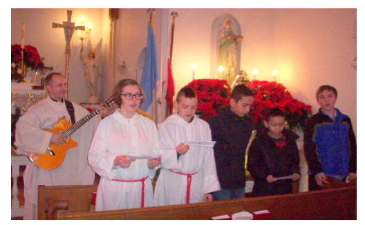
Youth choir performed at installation Mass.