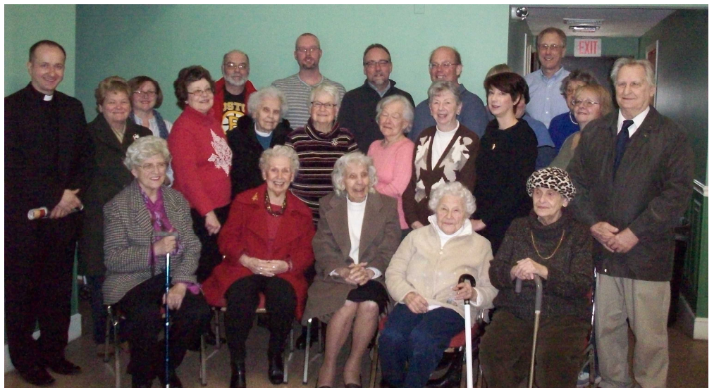
The newly elected parish committee for 2014 who attended the traditional brunch following installation Mass and ceremony on Sunday, January 5.