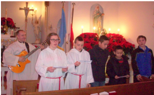
Youth choir performed at installation Mass.