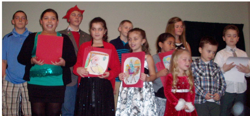
Children of the parish presented a special program to add to the spirit of the event