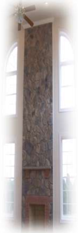
Richardson Homes, The Carrington