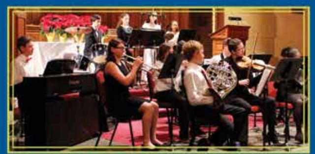
Winterfest 2016 featured our amazing performing artists in the Harkness Chapel at Connecticut College.