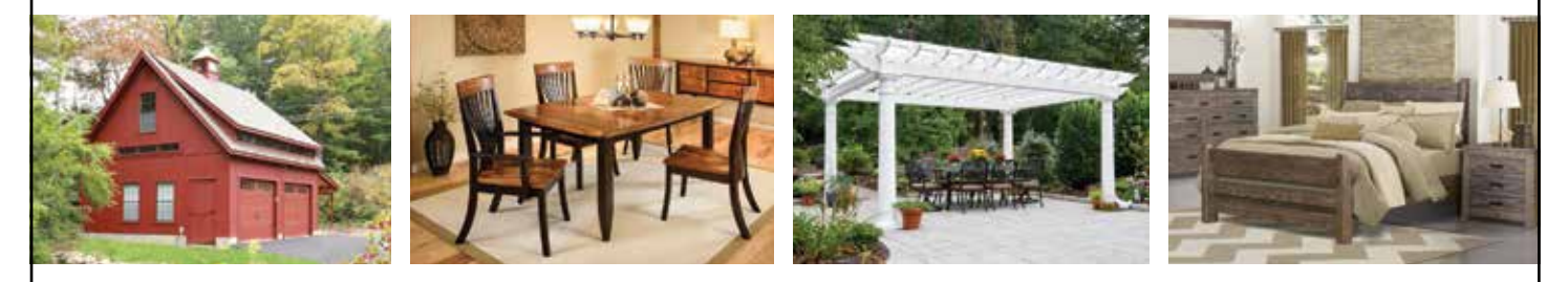
Visit us in Ellington! 16-Acre Outdoor Structure Display Park - Sheds, Garages, Gazebos, Pergolas, Pavilions and 2 Beautiful Showrooms filled with American-Made Solid Wood Handcrafted Furniture & Home Decor

KloterFarms.com | 860-871-1048 | 216 West Rd, Ellington, CT FREE DELIVERY in CT, MA, RI $1500 min. purchase. Extra charge for Cape Cod, MA