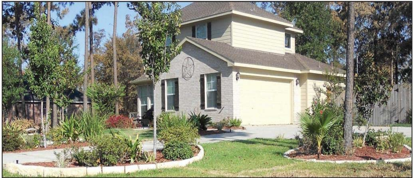
Island landscaping allows for space between fuels and will slow the spread of fire.