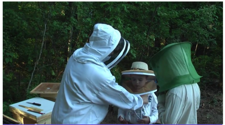
Although honeybees are usually very gentle creatures who mind their own business, it is usually best to wear protective clothing to avoid accidental bee stings.