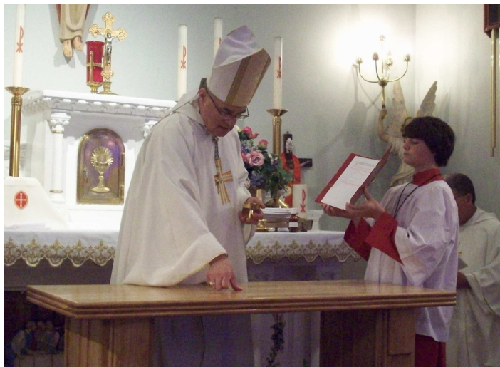
Bishop consecrates the new altar with Holy Oils and Sign of the Cross.