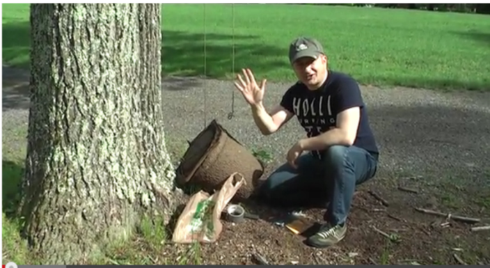
Czesc! Hi, and welcome to my beekeeping hobby. This is a swarm trap.

Several scenes from the video have been selected to be printed here: