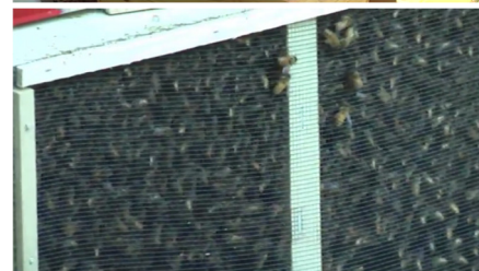
More information on the progress to the end result of the collection of honey for consumption is planned for future issues of this newsletter. To obtain a link to the YouTube video, send an email request to:

pastor@stcasimirspncc.com or check out our website at http://www.stcasimirspncc.com .