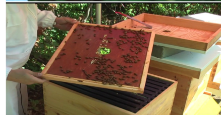
After the queen is released from the cage she starts laying eggs and soon the population in the colony rises rapidly to about 50-60,000 bees per colony.