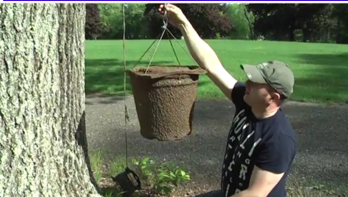
This swarm trap has been prepared and will be lifted to the top of this tree for the purpose of attracting additional honeybees.