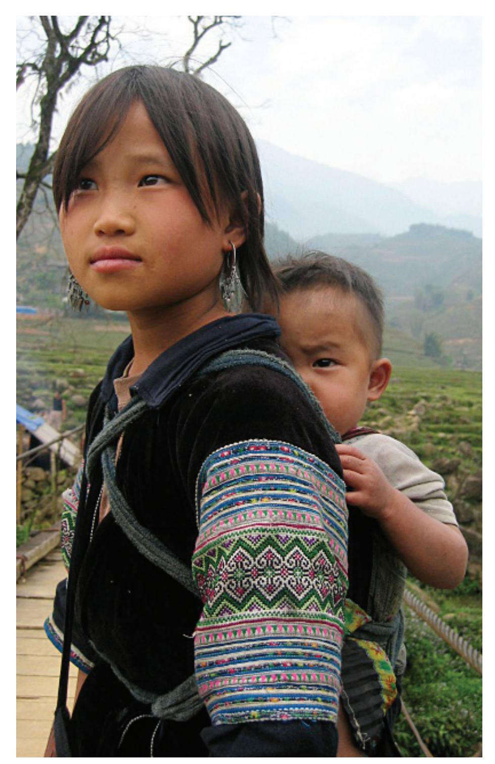
Young girl in Sapa/Lao Cai carrying her brother on a mountain bridge.