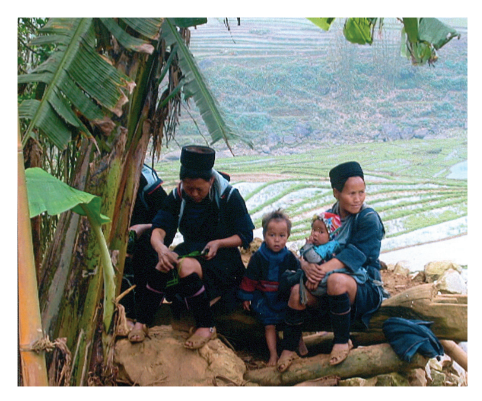
Above: Black H'Mong family at home

Vietnam has a very high incidence of urinary stone disease of the kidney and bladder. I will be donating an electrohydraulic lithotriptor to the hospital in Buon Ma Thuot. This is a machine, which can break up stones with shock wave treatment, therefore eliminating the need for open surgery. I have also been notified that the operating room has a lack of cardiac monitors and will be donating a cardiac monitor as well.