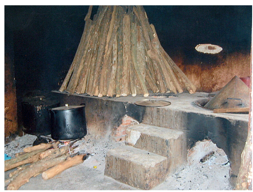
Kitchen of orphanage in Lao Cai

With the help of my charitable friends and patients, I think that MILPHAP-19 has been able to make a very substantial impact on the delivery of medical care in diverse regions of Vietnam. As you know, we have already established programs in Vinh Long, Nha Trang, Qui Nhon, Buon Ma Thout, Kon Tum and Lao Cai. The delivery of medical and surgical services at these hospitals has been greatly impacted by MILPHAP. My future plans are to establish programs in Pleiku, Ghia Nghia and Phan Thiet, which are in the central highland and costal areas.