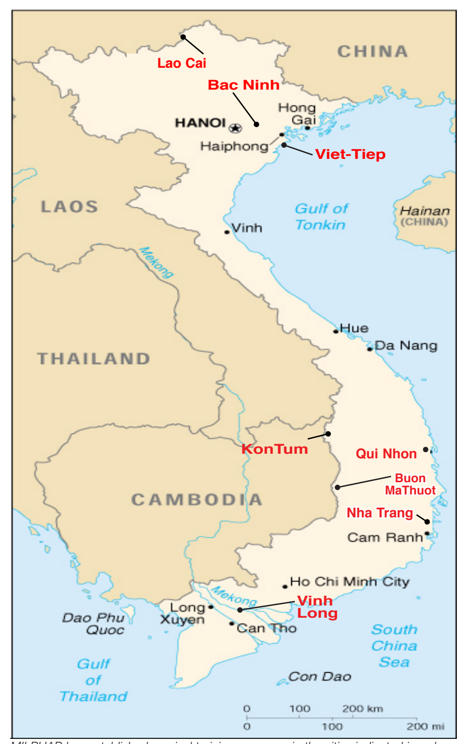
MILPHAP has established surgical training programs in the cities indicated in red.