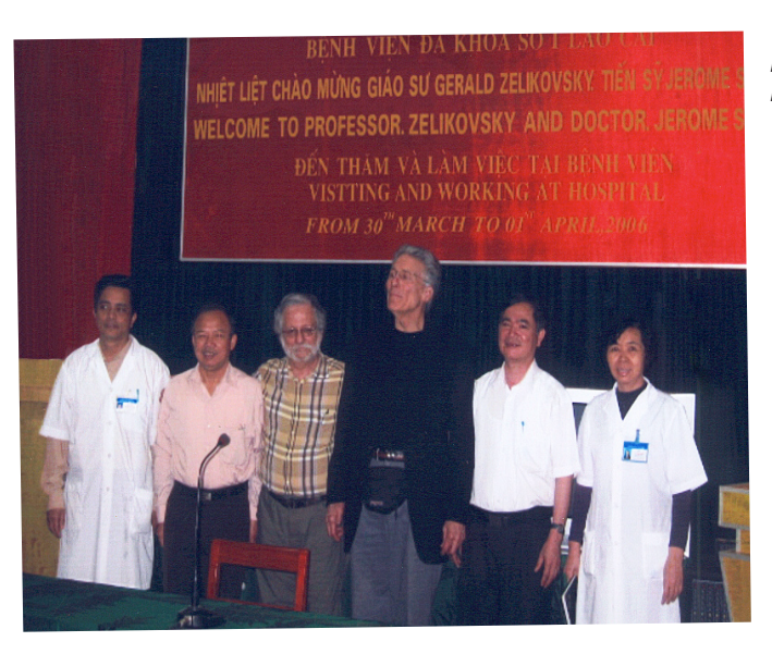
Left: Hospital reception at Lao Cai