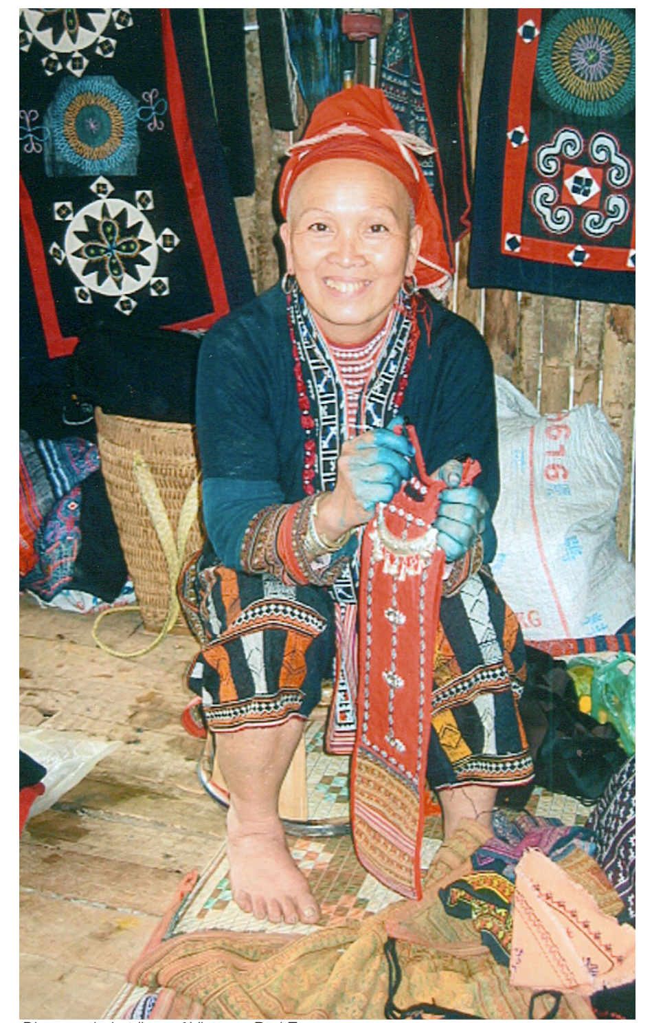
Diverse ethnic tribes of Vietnam-Red Zao

ducts. These are procedures, which are almost completely unknown in Vietnam and there is no surgical capability in all of Vietnam, with the exception of Saigon, where this procedure could be performed.