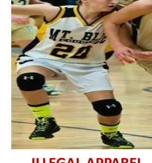
ILLEGAL APPAREL Color of headband and leg sleeves do not match.