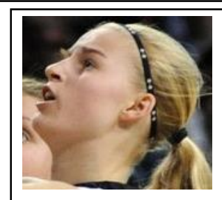
ILLEGAL APPAREL Too many logos