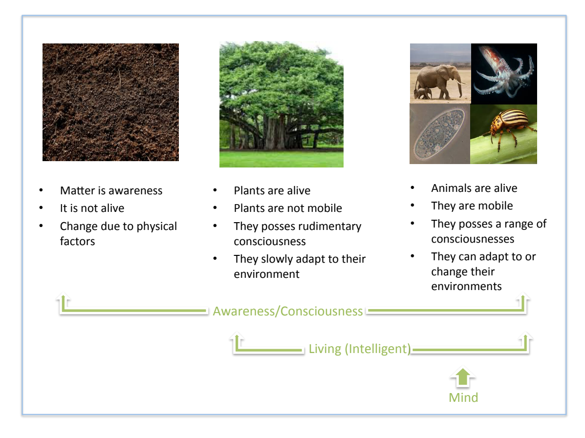
Figure 2 Consciousness, Living, and Mind

The main challenge for such a proposal is the same problem with all dualistic proposals: if there are two types of things coming together, how is it that they communicate? This problem of supervenience has hindered the development of dualistic models for hundreds of years. Modern physics might be able to provide a new way to think about this problem. For example, if the second type of energy/matter was dark matter, then it could interact with "normal matter" via gravity and/or the weak force. A model would still have to be developed to explain how this actually works, but at least there are potential mechanisms to exchange information across the two realms.