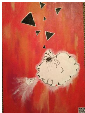
One of several unique pieces of temporary original art that can be found in Hutch. Check out story.

it's not permanent, he said, but it stays for a while.) See Full Story & others connected in The Bee: http://hutchnews.com/thebee/BEE--Third-Thursday-4