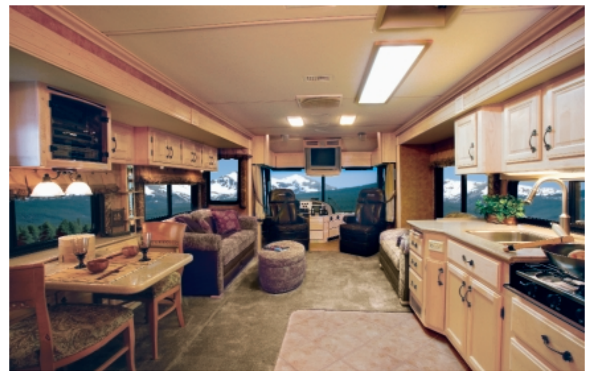
40L Collection Interior, shown with Clear White Maple Wood.