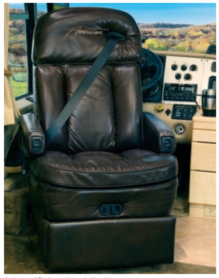
An integrated 3-point seat belt and adjustable armrests make this the most comfortable seat in the house.