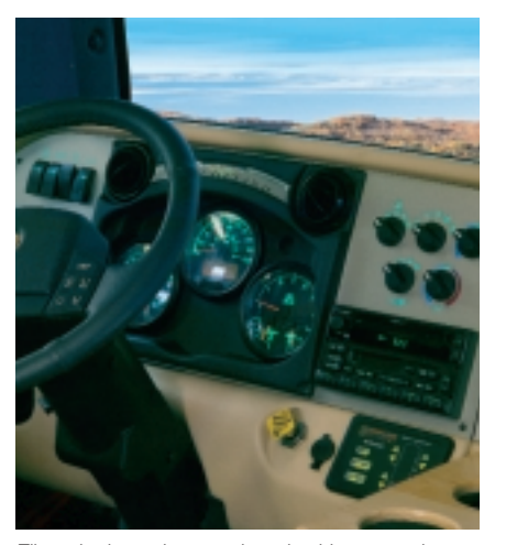
Tilt and telescoping steering wheel is yet another creature comfort.

Tradition for 2004 also offers an exterior temperature gauge & compass, optional Onstar, optional Night Vision, optional Satellite radio, optional GPS Navigation System and optional Air with Hydraulic Leveling system.