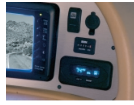
An exterior temperature gauge and compass are now integrated into the dash.