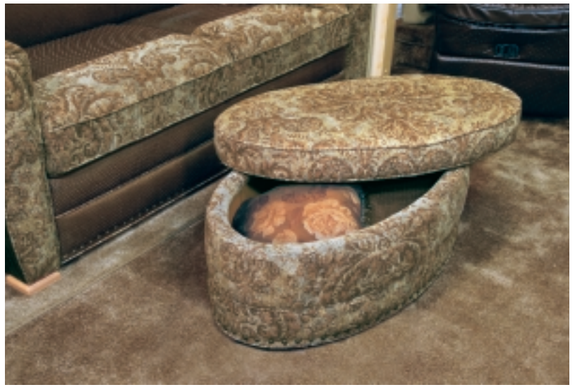
Optional fabric ottoman opens up for convenient additional storage.