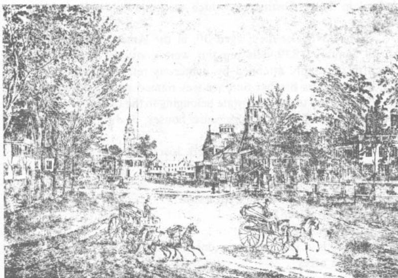
Keene as it appeared during the closing years of the glass industry