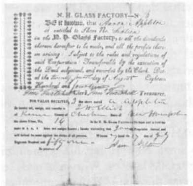
Share no. 16—N. H. Glass Factory

In October the directors met to discuss building "a house or