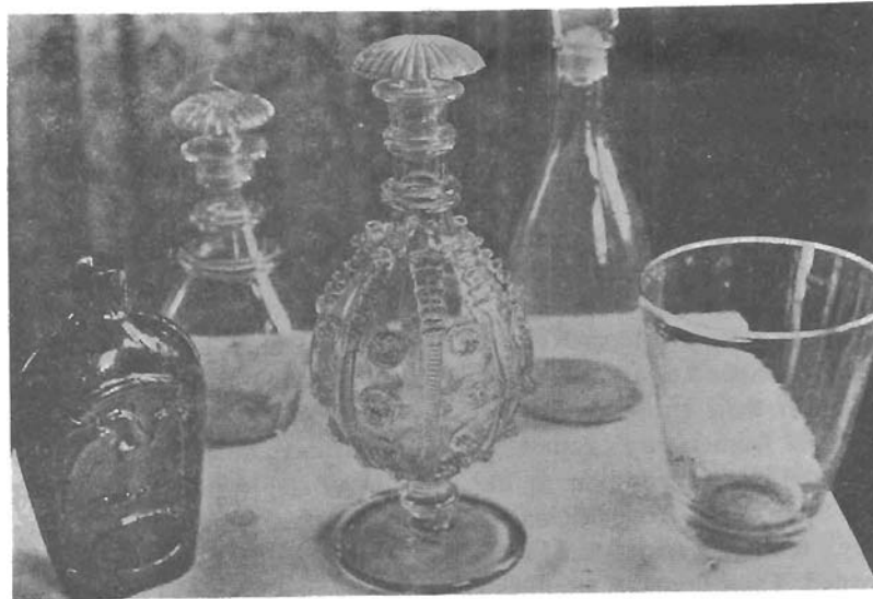
Glassware in front row made by Marlboro Street factory— tumbler & decanter under Schoolcraft in 1816; flask by a later concern; two rear decanters of unknown origin

dians whereby 16,000,000 acres of land were added to the U. S. and authored many works, ranging from an autobiography to A View of the Lead Mines of Missouri . It was he who inspired Longfellow to write Hiawatha and a few years before his death in 1864, he began preparation, under a Congressional appropriation, of an elaborate work entitled Ethnological Researches Respecting the Red Man in America .