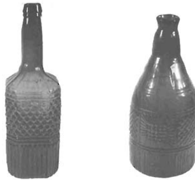
Blown three mo'd decanters, or bottles, in heavy dark glass

wide, 16 feet high and 2½ feet thick, to be laid in lime mortar. The materials to be delivered near the spot, to commence about the first of April next. Also for finding the materials and putting on the roof to said building, or the timber." Before long a large and substantial stone building replaced the earlier wooden structure and bottles of every description found their way to a growing market. Blown three mold glass, America's ingenious inexpensive answer to the fashionable high-priced cut glass, was also manufactured here, the principal commercial items being inkwells and quart and pint decanters. This output continued until the introduction of pressed glass at other factories caught the public fancy and interest in blown three mold ware declined.