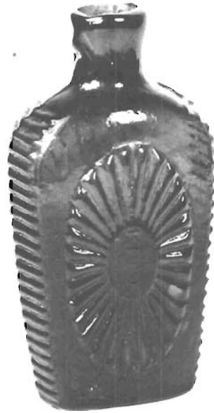
Sunburst—note spelling Keen instead of Keene