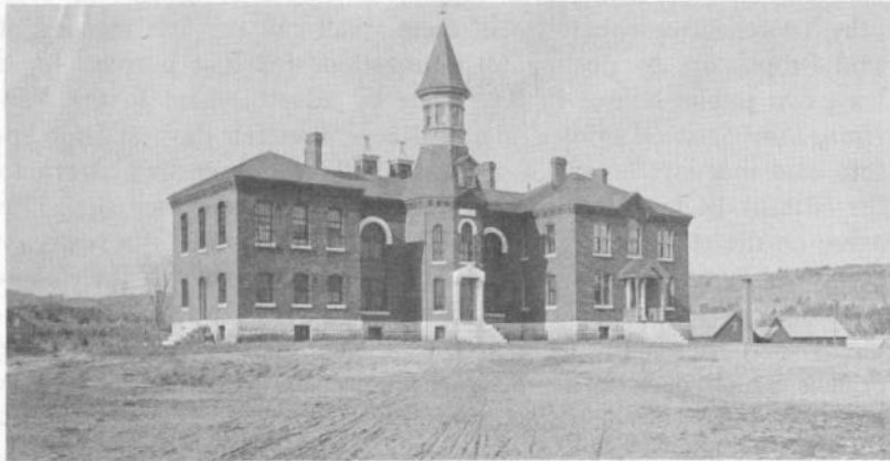
Cheshire County Jail on what is now Fuller Park former location of N. H. Glass Factory

In March, prior to Schoolcraft's engagement as superintendent, a notice appeared in the New Hampshire Sentinel proposing a glass factory "90 feet long, 60 feet wide, and 20 foot posts and 40 foot rafters, to stand about 1/2 mile northeasterly from the meetinghouse