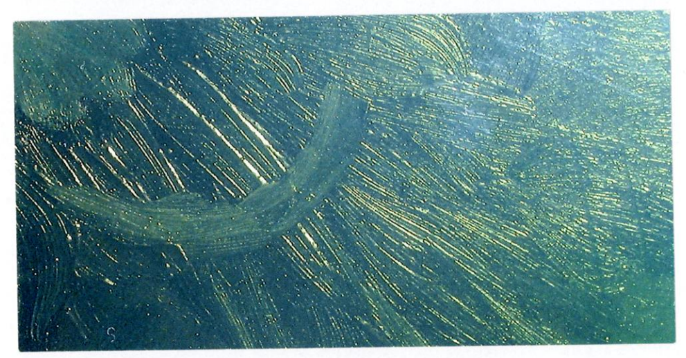
Fig. 6: Brush strokes, holographic reproduction.