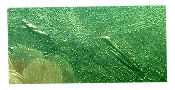
Fig. 5: Detail, holographic reproduction.