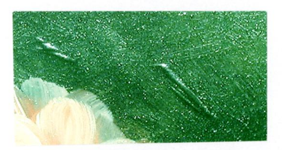
Fig. 4: Detail, original painting.