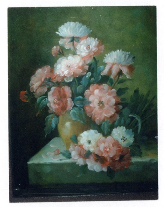
Fig. 2: Original painting.