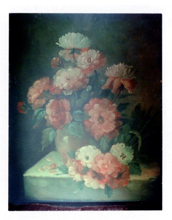
Fig. 3: Holographic reproduction.