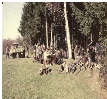
Lunch time at the Jaut - Lunch is brought out to the field. Here there are the Jagers, shooters, beaters, picker-uppers and dog men. The wagon shown is moved around and taken to be used to pick up the harvested game.