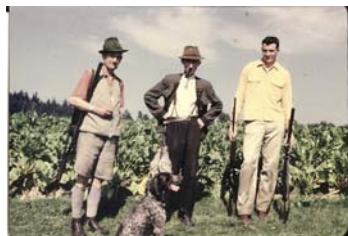
We hunted on land that was farmed, and there were a lot of Hungarian Partridge in large flocks like quail. The person in the middle runs the dog(s) and carries the game.