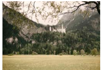
DIFFERENT AREAS OF HUNTS