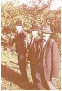
This is a picture of 3 Jagers who take care of a certain areas of the country, which is in their area, and determine how many birds can be harvested.