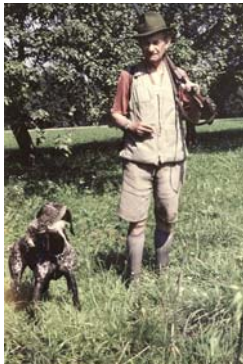
A private hunt- The Jager was a German Colonel