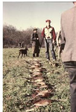
On a driven hunt, they tag the birds each has shot and you either buy them or the land owner takes them to market, and they are sold as you see them.