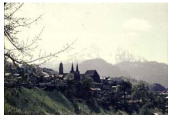
LEAVING THE OUTSKIRTS OF SALZBURG FOR A SMALL DRIVE IN THE NEIGHBORING VILLAGE