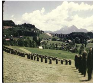
The areas mostly hunted were within 10 to 15 miles of Salzburg Austria. This was a cut of field where they build fences and put the hay up to dry.