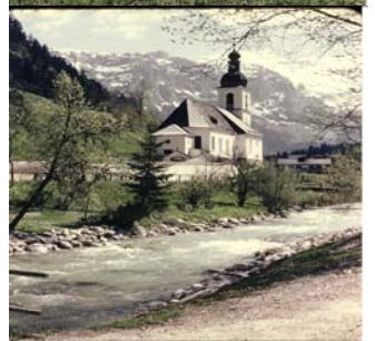
THE ABOVE TWO PICTURES ARE SOME OF THE FIELDS AND BACKGROUND WHILE ON PRIVATE HUNTS.