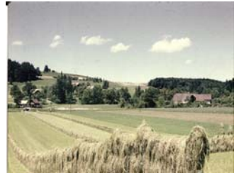
YOU CAN SEE THE ROTATION OF CROPS AND A LITTLE DIFFERENT WAY THE