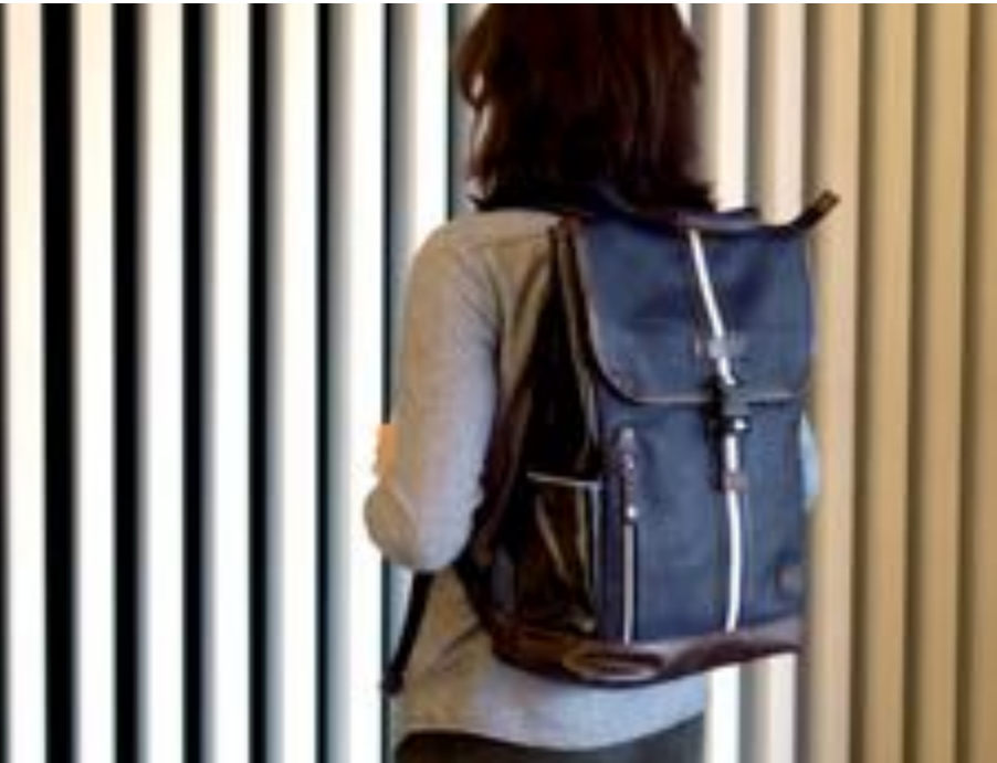
PORTSMAN FLAPTOP BACKPACK