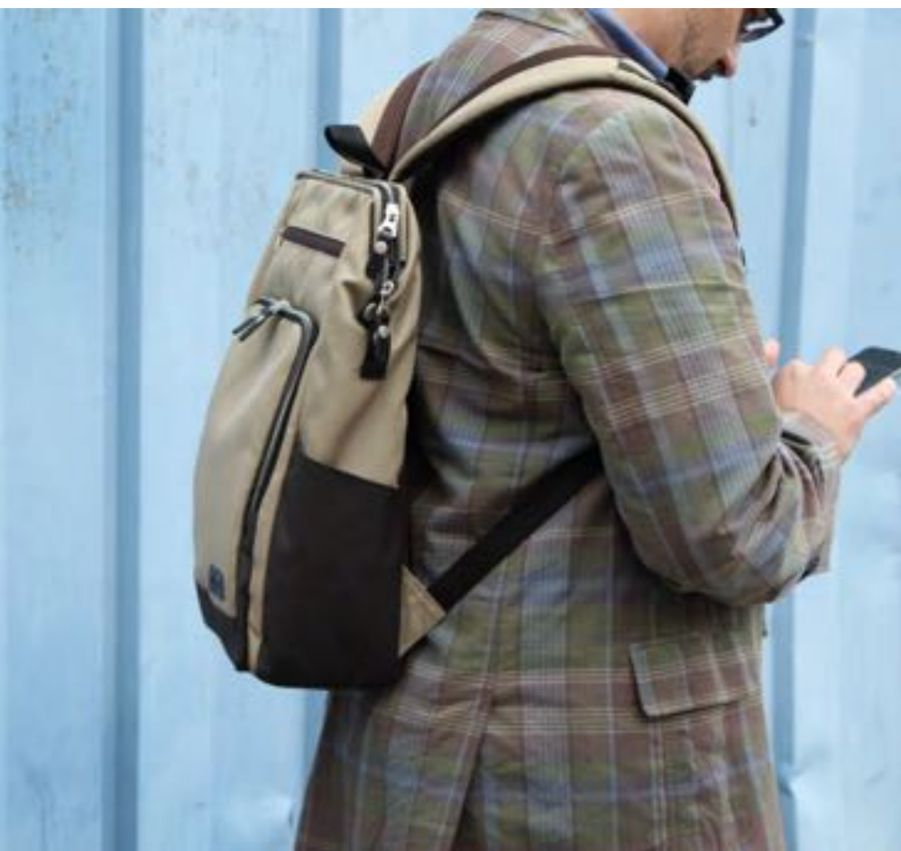
GABA CITY TWO-TONE BACKPACK