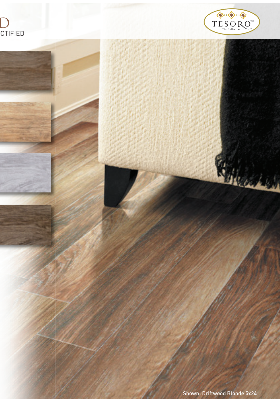
Shown: Driftwood Blonde 5x24