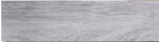
Ocean Breeze Gray